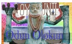
Odun Olokun February 22-24, 2013