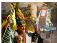
Igbe Ga Alade February 8-11, 2013