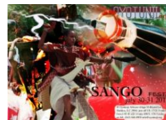
Odun Sango July 26-28, 2013