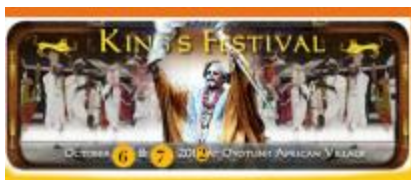
Odun Oba ati ATA Annual Meeting October 4-6, 2013