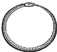
Damballa Hwedo October 31, 2013