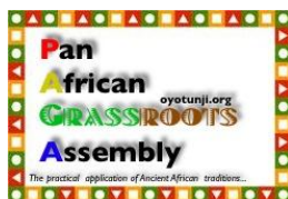
Odun Ifa ati Pan-African Grassroots Assembly July 4-7, 2013