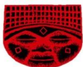
Orita Festival April 22-24, 2013