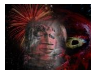
Yoruba New Year March 21, 22-24, 2013