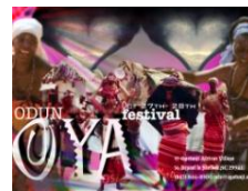
Odun Oya October 25-27, 2013