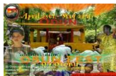
Odun Osun May 3-5, 2013