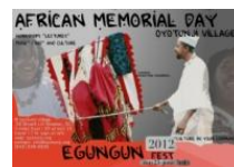
Festival of Egungun May 24-June 2, 2013